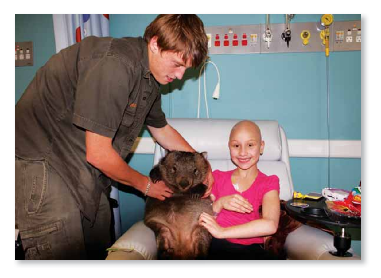
PAGE 8 NSW HEALTH Animal Visits & Interventions in Public and Private Health Facilities

Decisions about which patients would most benefit from an animal intervention and for whom risk is low, sits with the patient's clinical team and a patient's carer.