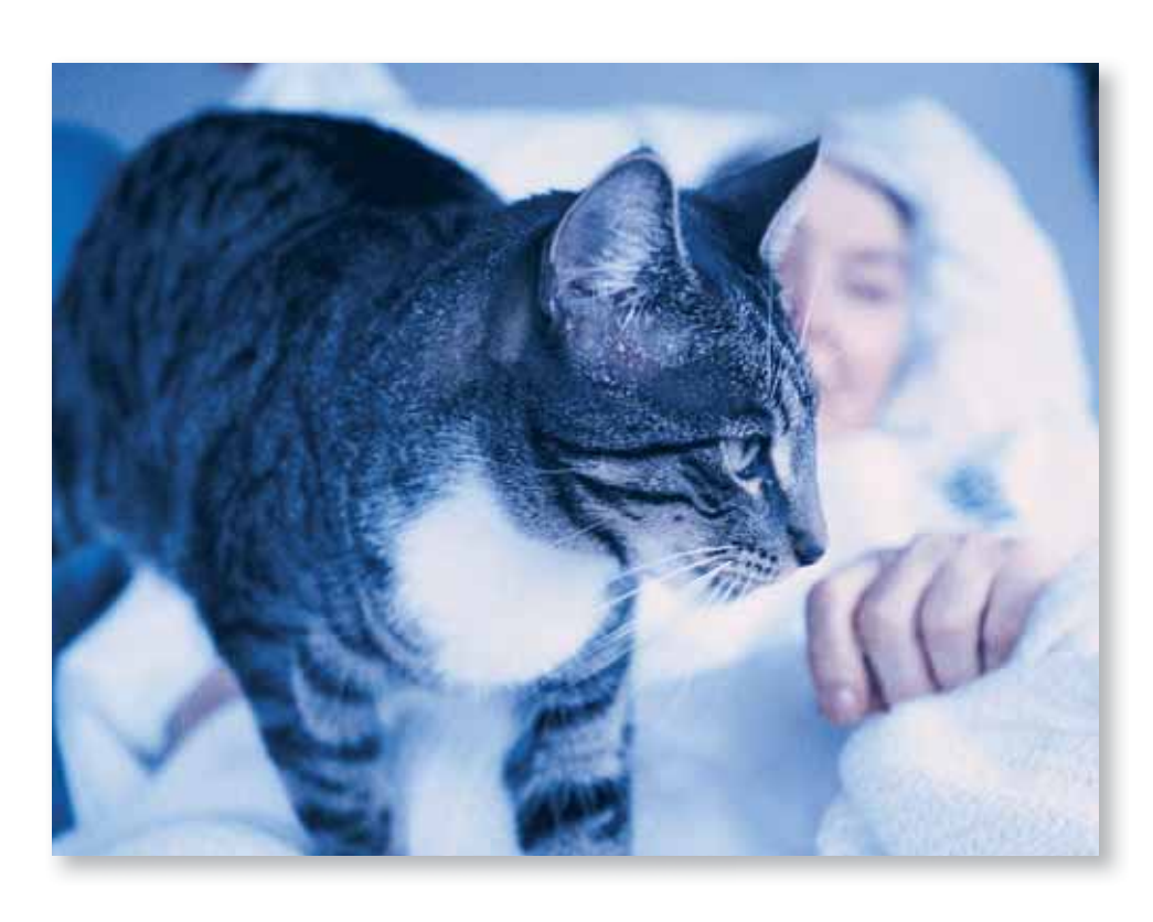
PAGE 20 NSW HEALTH Animal Visits & Interventions in Public and Private Health Facilities