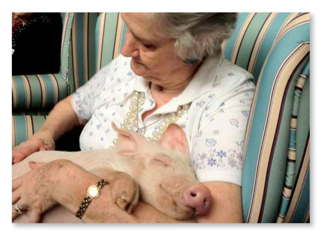
PAGE 16 NSW HEALTH Animal Visits & Interventions in Public and Private Health Facilities